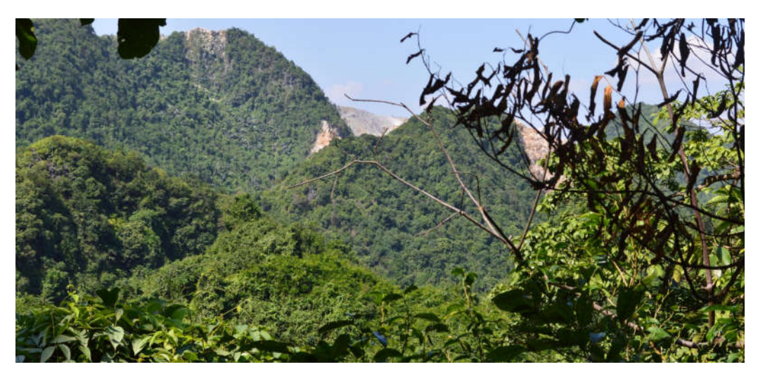
Figure 3. Habitat of Cyrtodactylus soni in limestone forest of Thanh Son commune, Kim Bang district, Ha Nam province